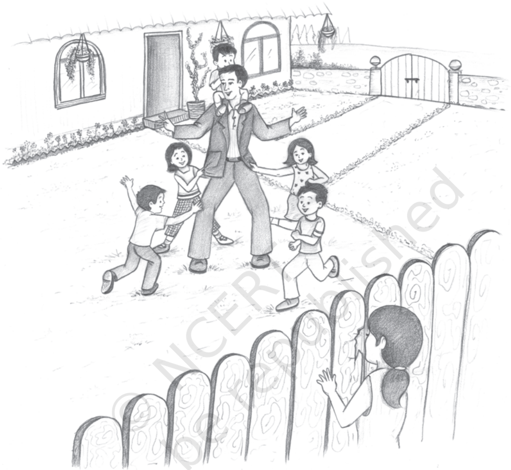
The little girl saw through a gap the Macdonalds playing 'tag' in the evening.

but while Alice was putting her to bed she grew suddenly afraid.